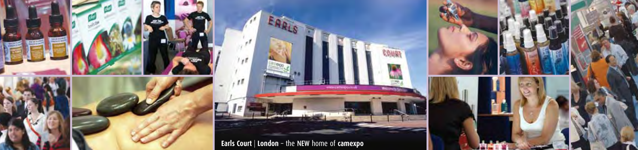
Earls Court | London – the NEW home of camexpo

“ It’s been a successful show for us. It’s helped us to enter a new and exciting market for virgin coconut oil – the reception from practitioners has been very positive. ”